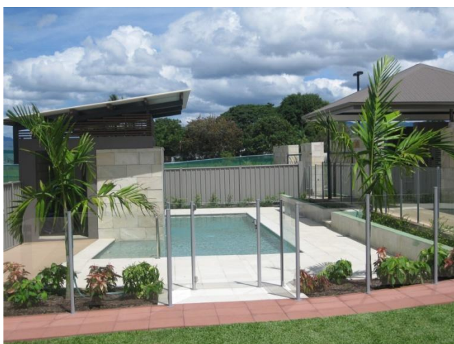
First heated pool completed

The centerpiece of the development is a $5 million dollar clubhouse. The 600m 2 entertainment centre will feature a 25 seat cinema, arts and crafts room, library, games room and tai chi terrace. A sports club and residents lounge will be supported by a commercial standard kitchen for catering plus a fully-equipped handyman workshop for those who still wanted to tinker in the tool shed! It will also boast a state of the art recreational facility with a ballroom and dance floor. A total of two pools further enhance the resort style community together with a tennis court, gymnasium and aerobics pool. The local bowls club is conveniently located across the road for those who play.